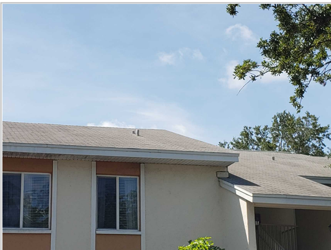
Roof Covering: Asphalt/Fiberglass Shingles