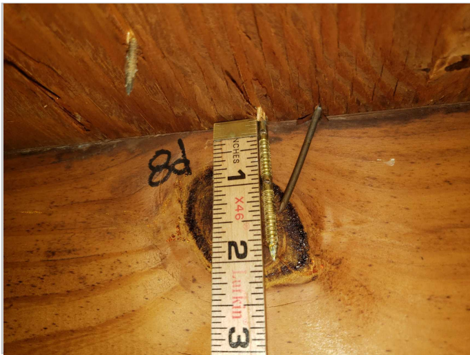
Roof Deck Attachment: 8D Nails