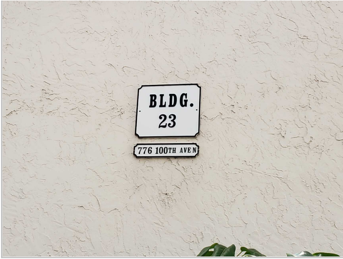
776 100th Ave N