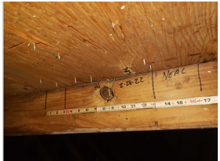
Roof Deck Attachment: 8D Nails (= or < 6" On Center)