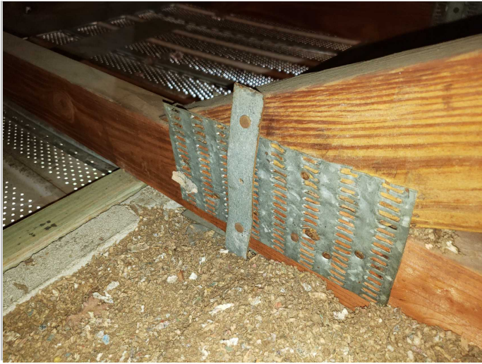
Roof to Wall: Connectors Don't Meet Requirements