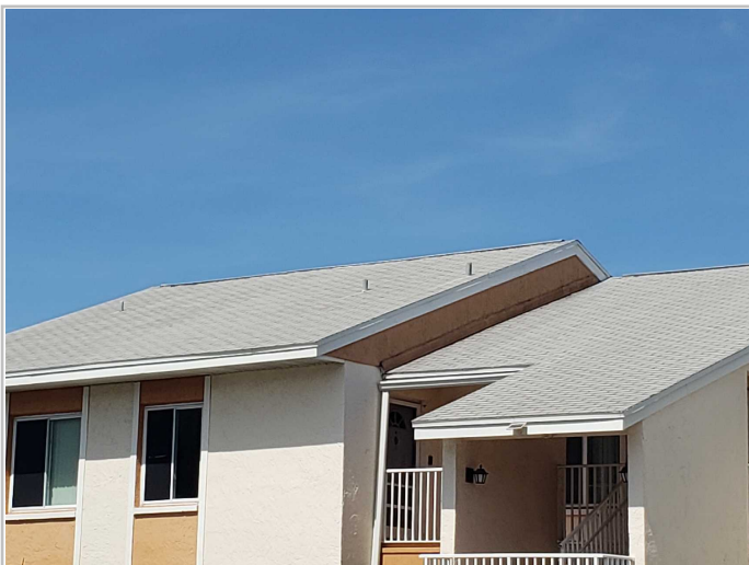
Roof Covering: Asphalt/Fiberglass Shingles