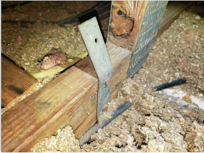
Roof to Wall: Connectors Don't Meet Requirements