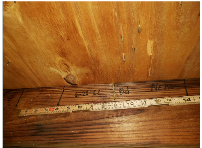
Roof Deck Attachment: 8D Nails (= or < 6" On Center)