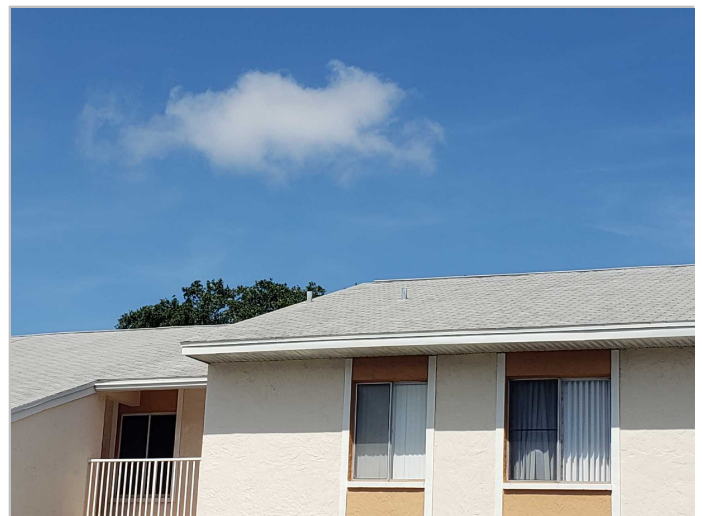
Roof Covering: Asphalt/Fiberglass Shingles