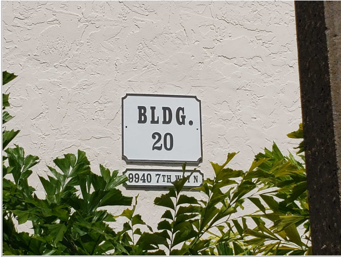
9940 7th Way N