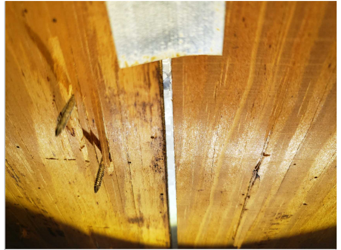
No Secondary Water Resistance (SWR)