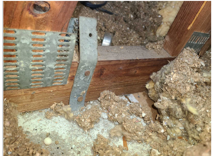
Roof to Wall: Connectors Don't Meet Requirements