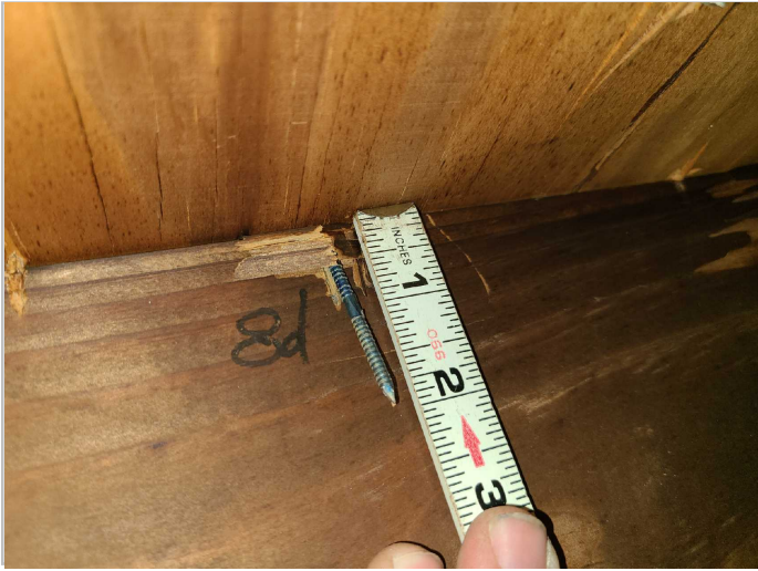
Roof Deck Attachment: 8D Nails