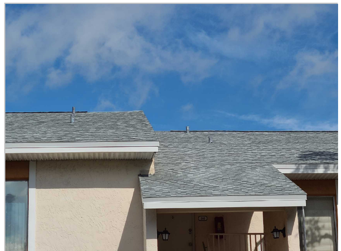
Roof Covering: Asphalt/Fiberglass Shingles