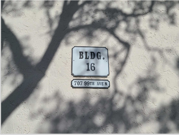
707 99th Ave N