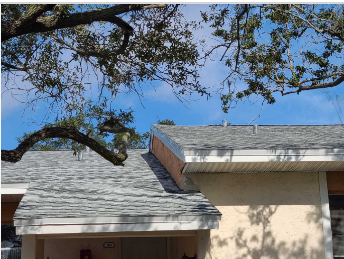
Roof Covering: Asphalt/Fiberglass Shingles