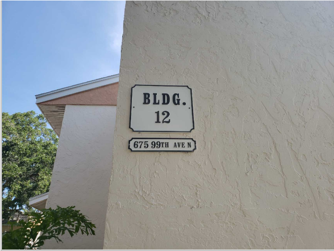
675 99th Ave N