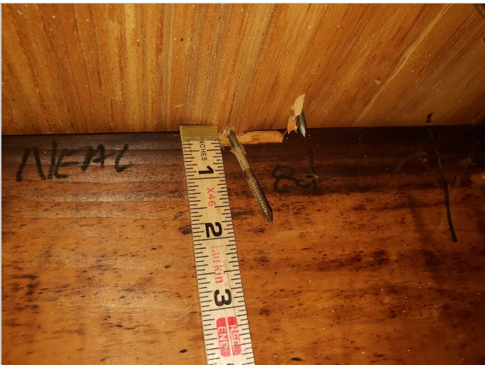
Roof Deck Attachment: 8D Nails