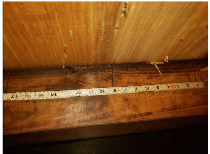
Roof Deck Attachment: 8D Nails (= or < 6" On Center)