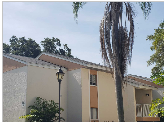
Roof Covering: Asphalt/Fiberglass Shingles