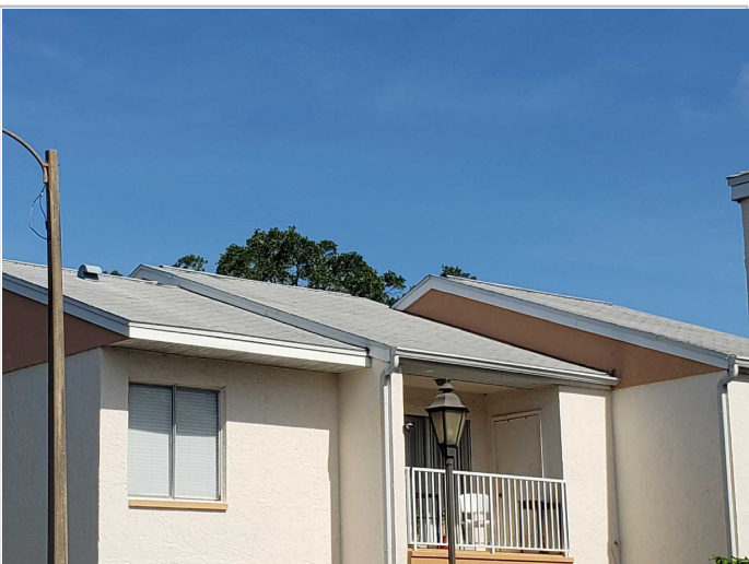
Roof Covering: Asphalt/Fiberglass Shingles