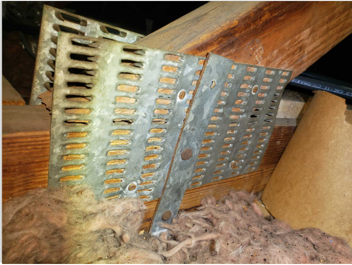
Roof to Wall: Connectors Don't Meet Requirements