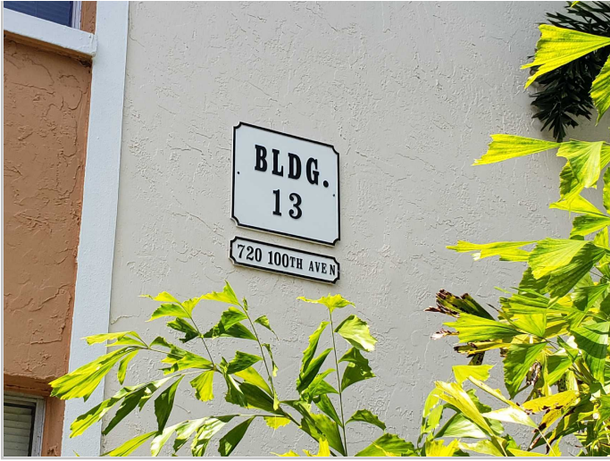
720 100th Ave N