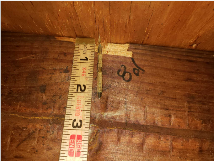
Roof Deck Attachment: 8D Nails