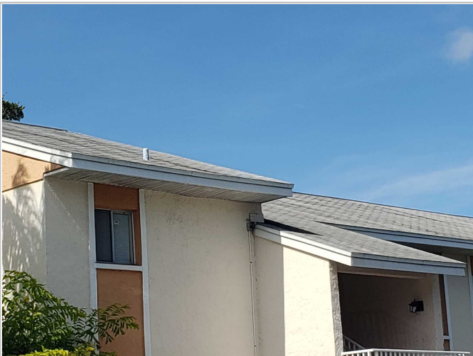
Roof Covering: Asphalt/Fiberglass Shingles