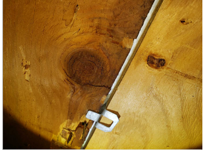
No Secondary Water Resistance (SWR)