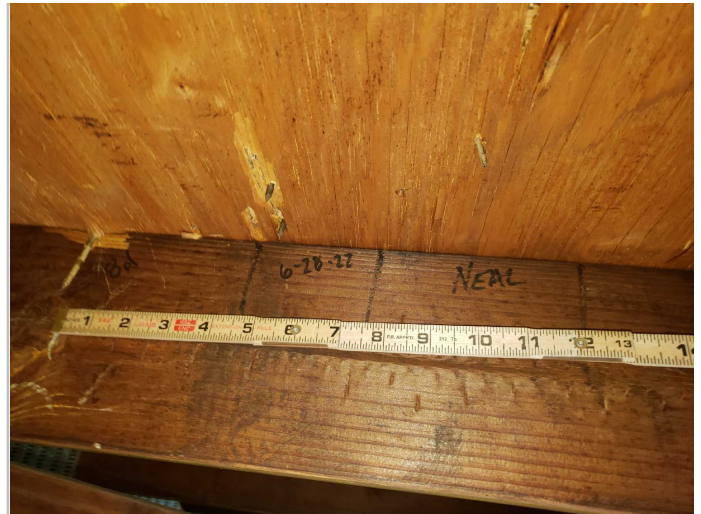
Roof Deck Attachment: 8D Nails (= or < 6" On Center)