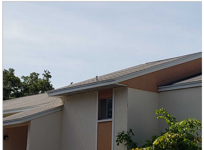
Roof Covering: Asphalt/Fiberglass Shingles