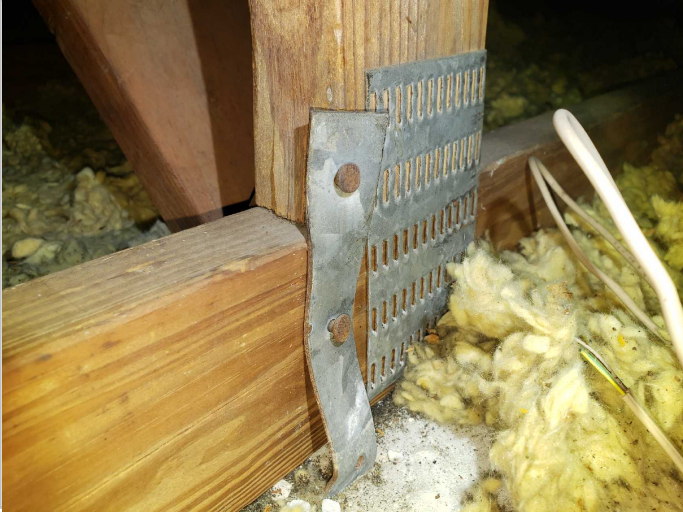
Roof to Wall: Connectors Don't Meet Requirements